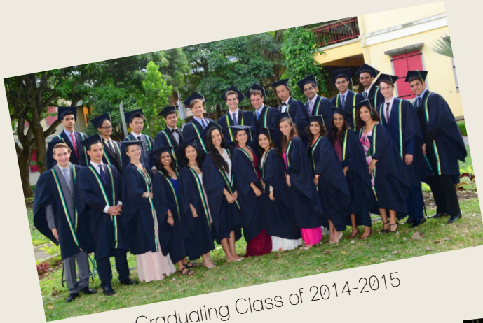
Graduating Class of 2014-2015