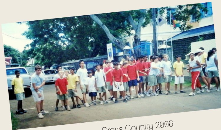
Interhouse Cross Country 2006