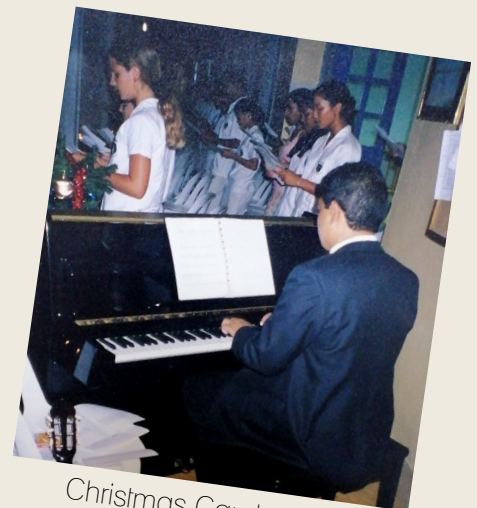
Christmas Carols 2005