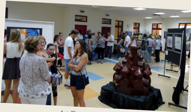
Art Exhibition 2015