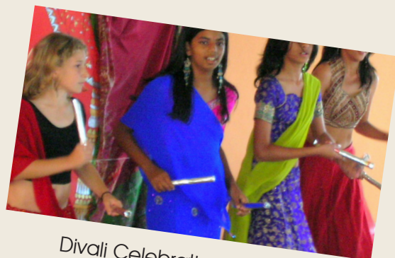
Diwali Celebration of 2006