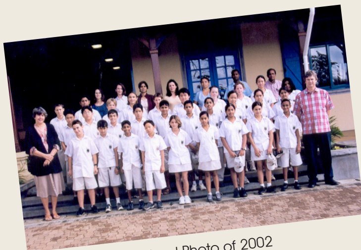
First School Photo of 2002