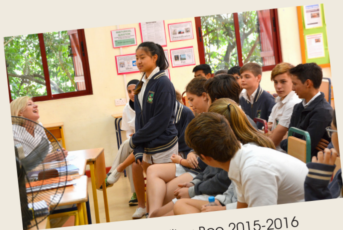
Interhouse Spelling Bee 2015-2016